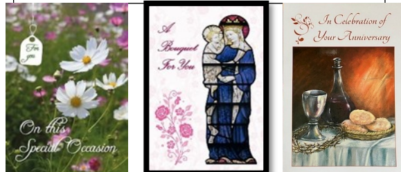
SO 4 ABFY 1 AN 1