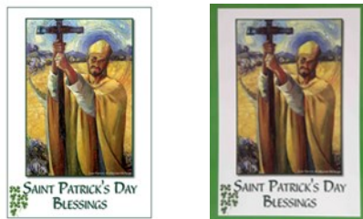
SPD 1 Greeting Card