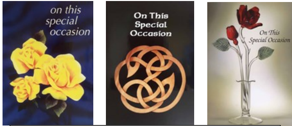
SO 1 SO 2 SO 3