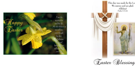
E 1 E 2