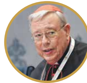
Jean-Claude Hollerich SJ. - Luxembourg - 66