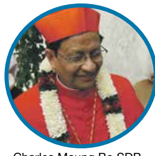
Charles Maung Bo SDB. - Myanmar - 76