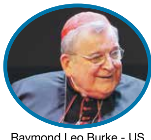
Raymond Leo Burke - US - 76