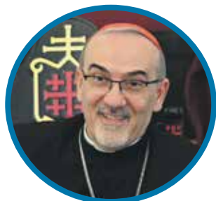
Pierbattista Pizzaballa OFM. - Jerusalem - 60