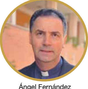
Ángel Fernández Artime SDB. - Spain - 64