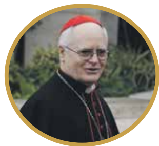
Odilo Scherer - Brazil - 75