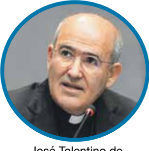
José Tolentino de Mendonça - Portugal - 59