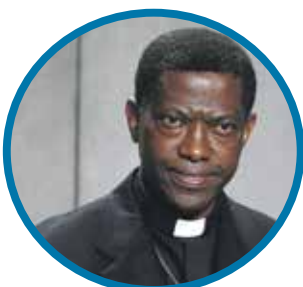
Protase Rugambwa - Tanzania - 64