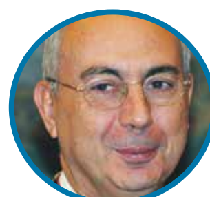
Dominique Mamberti - France - 73