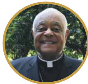
Wilton Daniel Gregory - US - 77