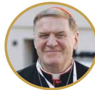
Joseph W. Tobin CSSr. - US - 72