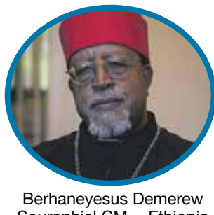
Berhaneyesus Demerew Souraphiel CM. - Ethiopia - 76