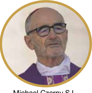
Michael Czerny S.J. - Canada - 78