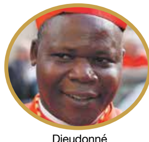
Dieudonné Nzapalainga CSSp. - Central African Republic - 58