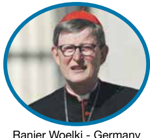
Ranier Woelki - Germany - 68