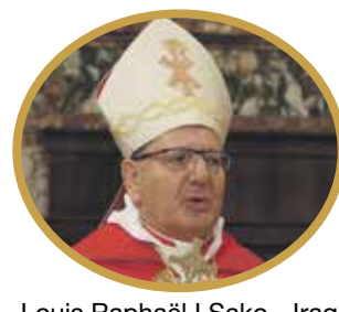
Louis Raphaël I Sako - Iraq - 76