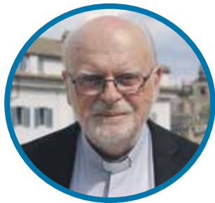
Anders Arborelius OCD. - Sweden - 75