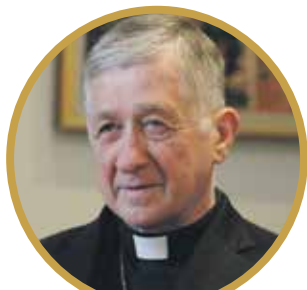
Blase J. Cupich - US - 76