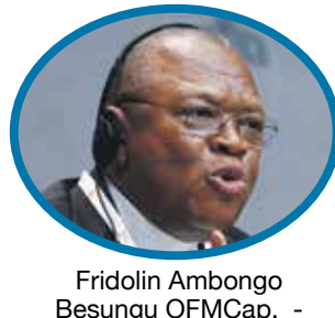
Fridolin Ambongo Besungu OFMCap. - Democratic Republic of Congo - 65