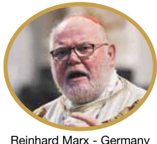
Reinhard Marx - Germany - 71