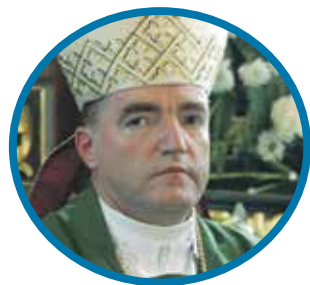
Josip Bozanić - Croatia - 76