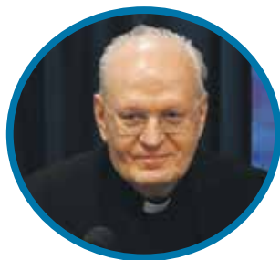
Péter Erdő - Hungary - 72