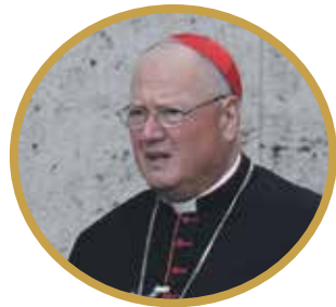
Timothy M Dolan - US - 75