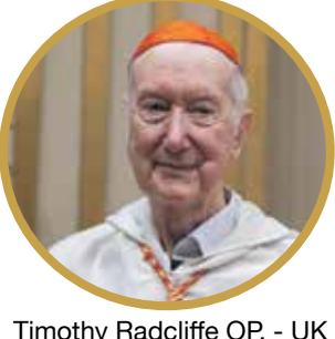
Timothy Radcliffe O.P. - UK - 79